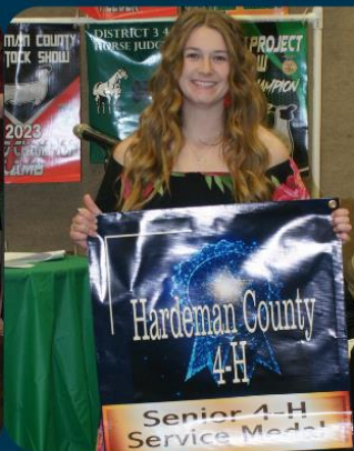
Senior 4-H Service Medal- Montana Woods