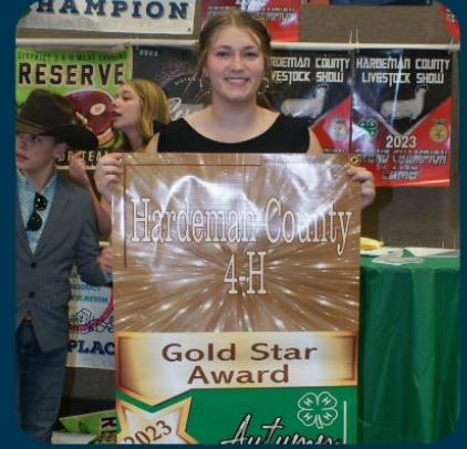
Gold Star- Autumn Woods