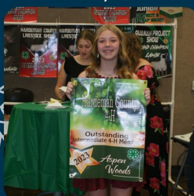
Outstanding Intermediate 4-H Member-Aspen Woods